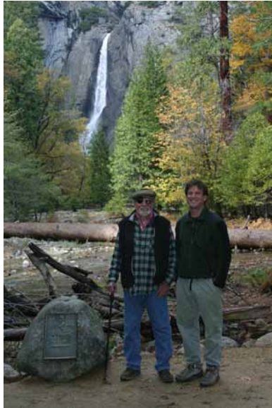
Site Visit to Lower Yosemite Falls Project – Nov., 2004

I worked with Larry Halprin on and off for 10 of the past 19 years. I began working for him in the fall of 1990 as a Design Assistant right out of college. We had some conversations where I may not have chosen my words carefully or I had casually represented an idea to him. His reproach in such instances could be blistering. He would be emphatic in pressing me to be more thoughtful in my approach and descriptions. His need to see and distill the essence of an idea and a thought in the most unambiguous manner sticks with me to this day.