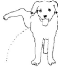
Fido Fountain 30" x

Many other styles available. Send for catalogue