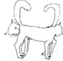
Friendly Felines 30" x