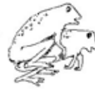
Ride 'em Kermit 25" x