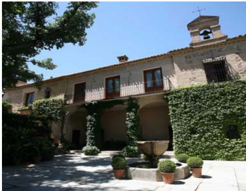
Cigarral de Menores