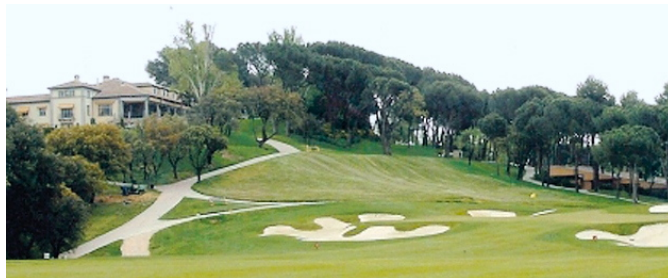
Real Club Puerta de Hierro

At noon, after a coffee break, we will visit the beautiful Chapel of San Antonio de La Florida totally decorated with Goya's fresco paintings. Then we will continue for lunch at the private Polo and Golf Club: Real Club de Puerta de Hierro that boasts "Velazquez Views" on the Sierra de Guadarrama. The club has a wonderful garden we will visit.