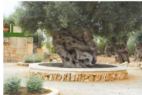
Ciudad del Santander