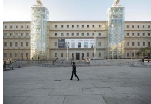
Jean Nouvel and Sabatini Entrances