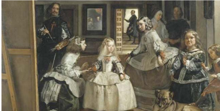
Las Meninas by Velazquez

Depart on foot for a special guided visit of the Prado Museum before its opening to the public. We will concentrate on works by El Greco, Velazquez & Goya.