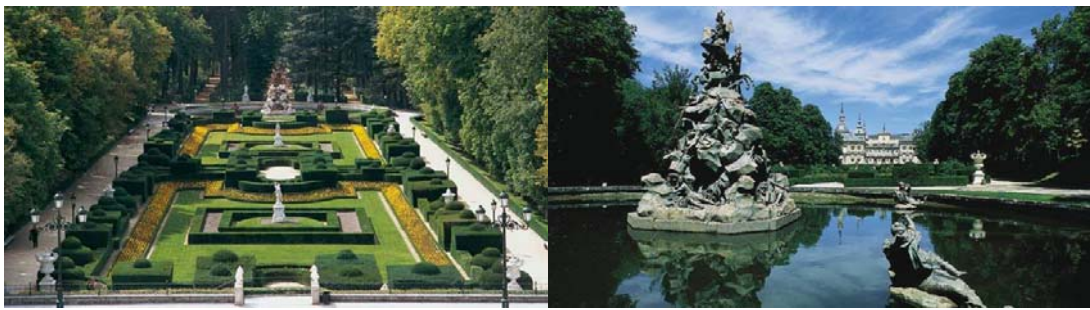
Gardens of La Granja

Return to Madrid for dinner on your own.