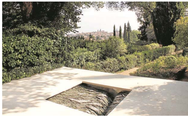
Pond by Cristina Iglesias