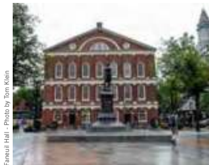
Faneuil Hall

Related Landscapes: Boston Navy Yard Bunker Hill Monument Dorchester Heights Faneuil Hall Freedom Trail Old North Church Old South Meeting House Old State House / Boston Massacre Site Paul Revere House