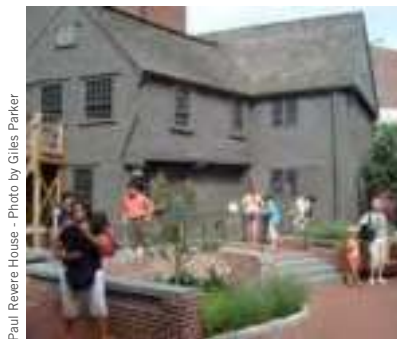
Paul Revere House