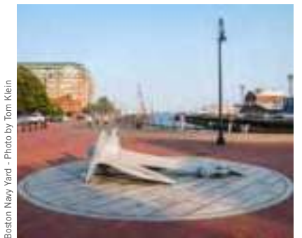
Boston Navy Yard