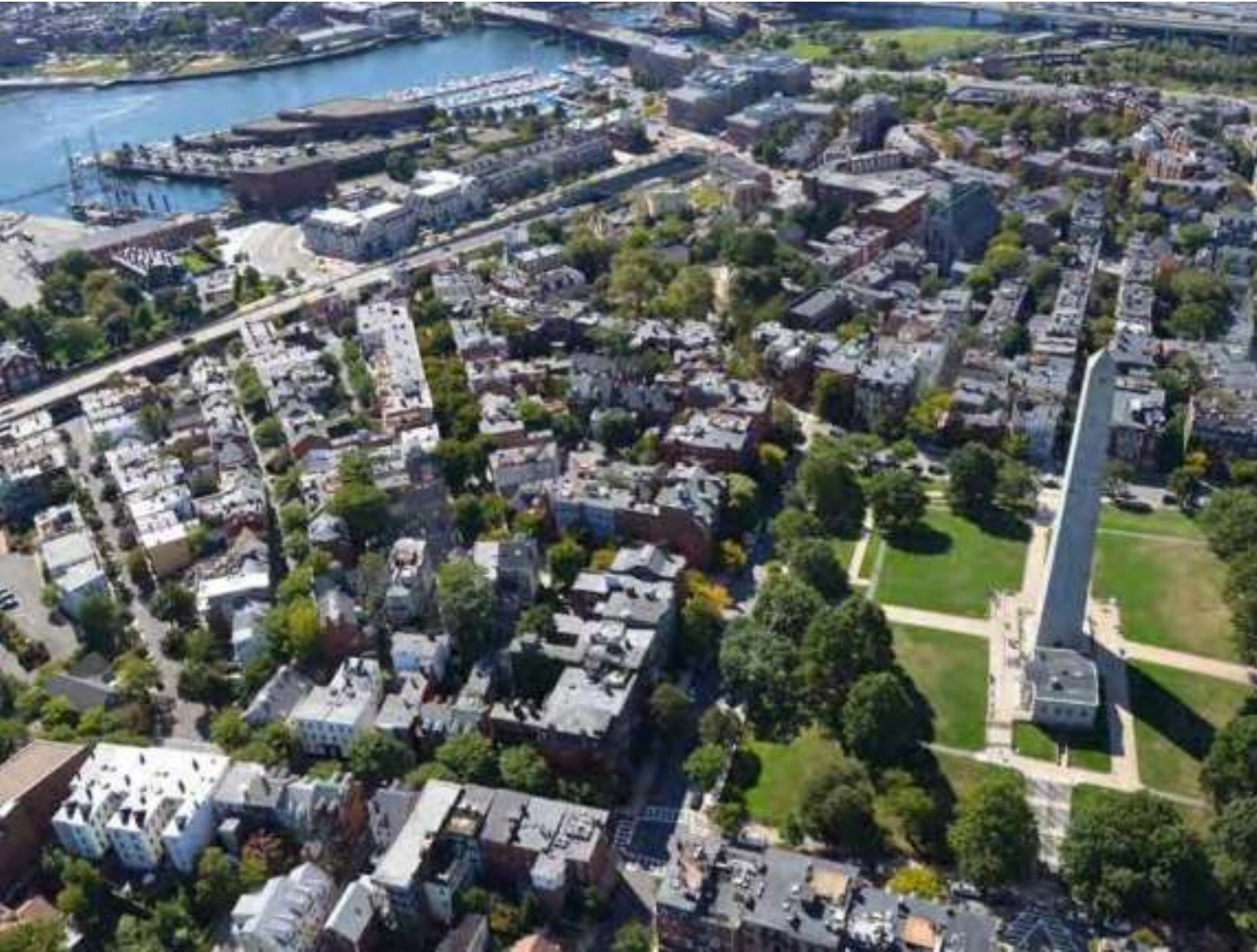
Bunker Hill Monument

Established in 1974, this 43-acre national park consists of eight historically significant sites that illustrate the events that led to the American Revolution in 1776 and the founding and growth of the United States. The historic properties include the Old South Meeting House, the Old State House, Faneuil Hall, the Paul Revere House, and the Old North Church in Downtown Boston; the Bunker Hill Monument in Charlestown; a portion of the Boston (Charlestown) Navy Yard including the USS Constitution; and, Dorchester Heights in South Boston. The National Park Service (NPS) works with many different partner organizations at this park, and with the exception of Dorchester Heights, all of these historic resources are also included in Boston's 2.5-mile Freedom Trail. However, unlike the Freedom Trail, Boston National Historical Park is composed exclusively of National Historic Landmarks.