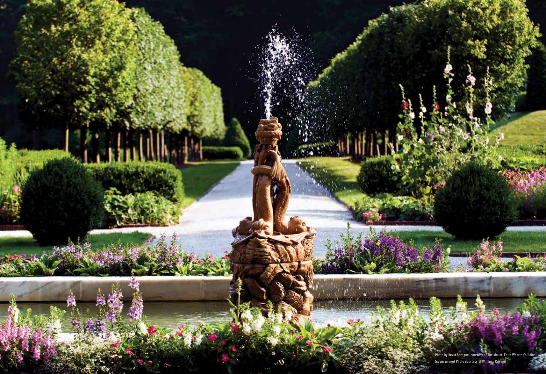
(cover image)