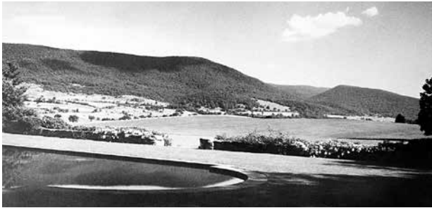
View of the George P. Cluett Estate, Williamstown

The firm designed several public projects in the town of Dalton, just east of Pittsfield, home to the headquarters of Crane & Co., one of the country’s most successful paper manufacturers. From 1897 to 1950, the Crane family commissioned the Olmsted firm to design four of the family’s estates, the grounds of their mill, the town cemetery, and the grounds of the town library which is named in their honor.