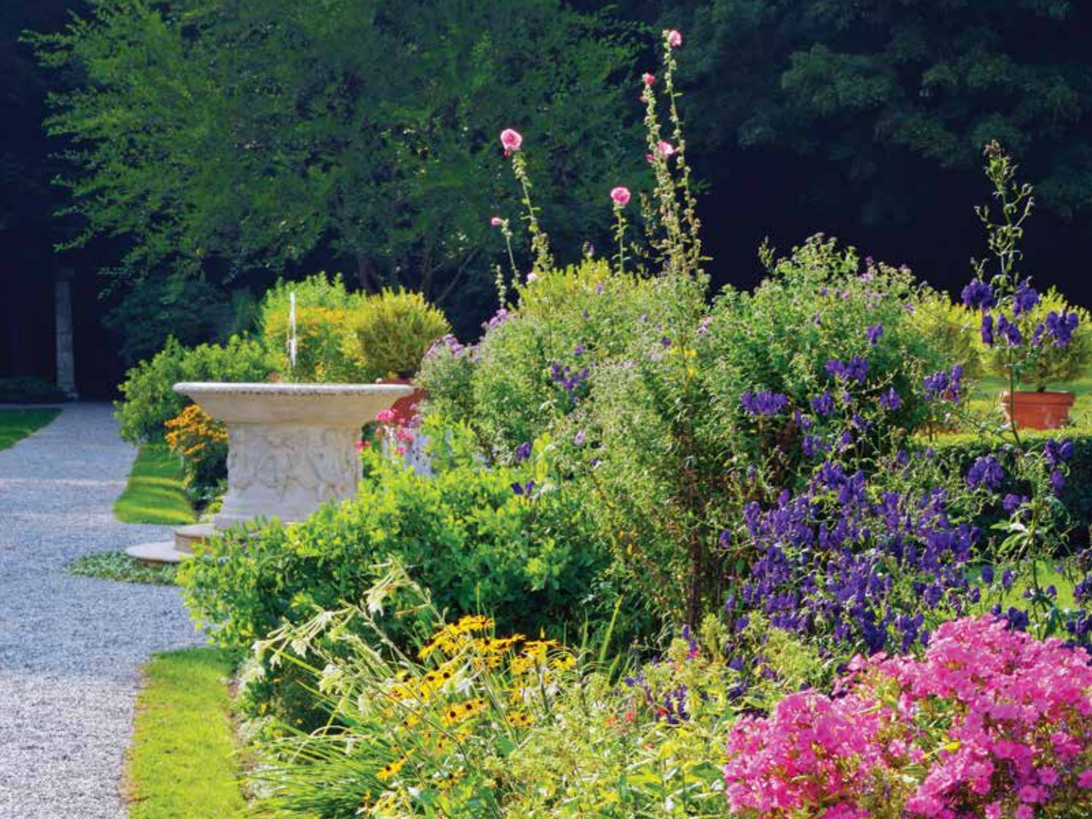
Chesterwood was designated a National Historic Landmark in 1965.