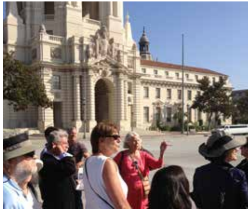
Pasadena Civic Center