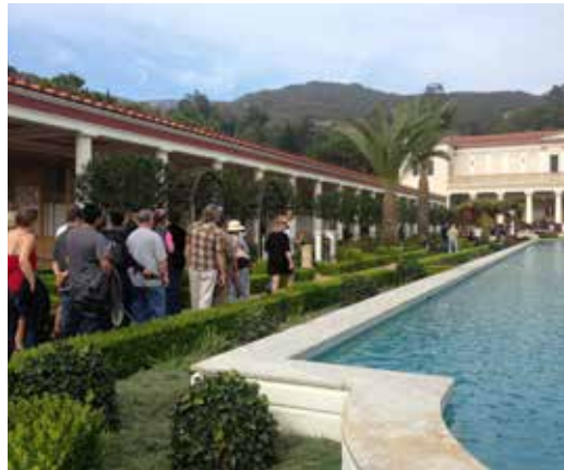
Getty Villa