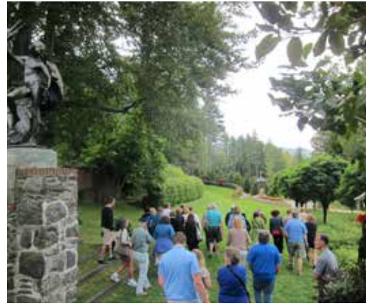
Naumkeag, photo by Charles A. Birnbaum