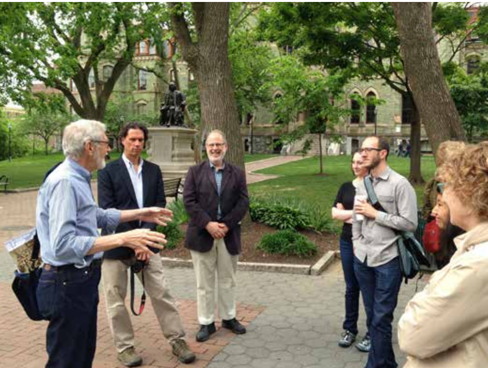
University of Pennsylvania College Green