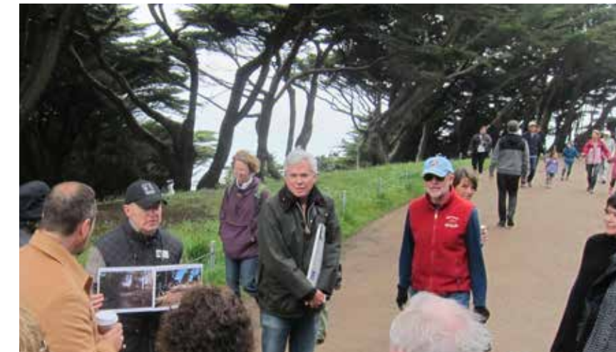
Lands End, photo by Charles A. Birnbaum