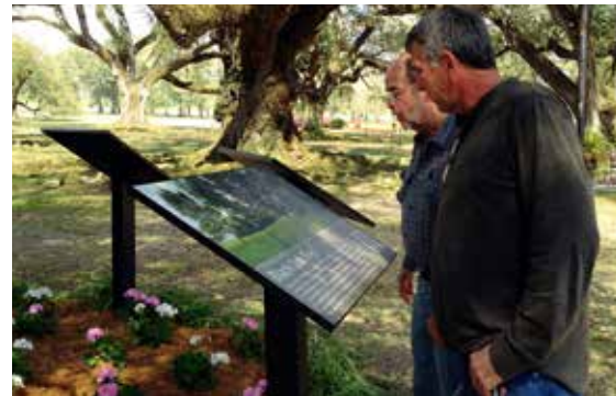
Signboard exhibition at Oak Alley Plantation, Vacherie, LA