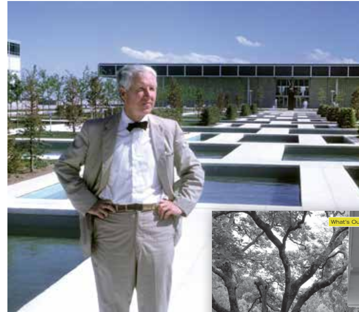
Dan Kiley at the US Air Force Academy