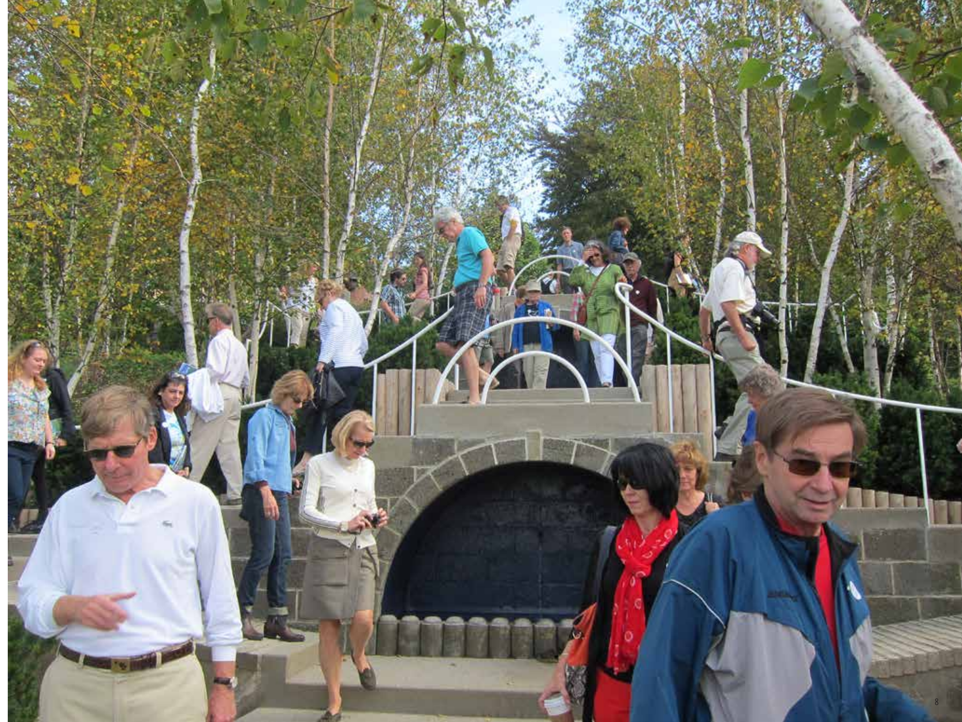
(opposite) Naumkeag