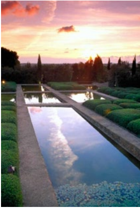
Camp Sarch. Menorca.