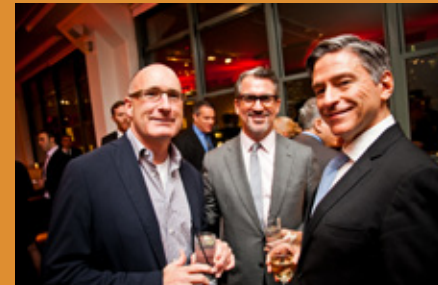
Hudson Highlands Garden Excursion; Bridging the Nature Culture Divide, Rye, New York; Sunnylands Tour, Rancho Mirage, CA; NYASLA Awards Dinner