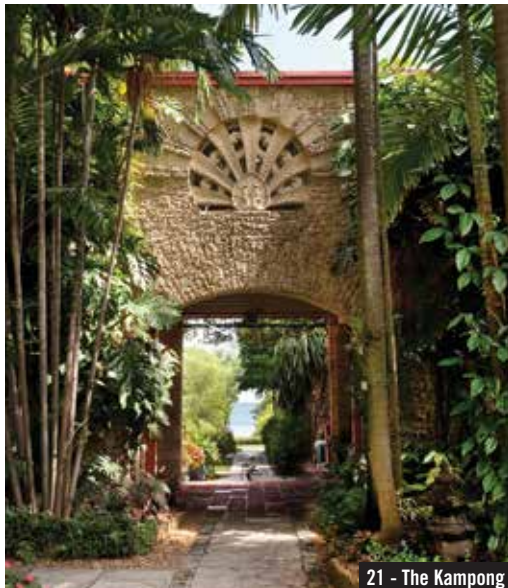
21 - The Kampong