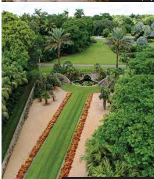
22 - Fairchild Tropical Botanic Garden