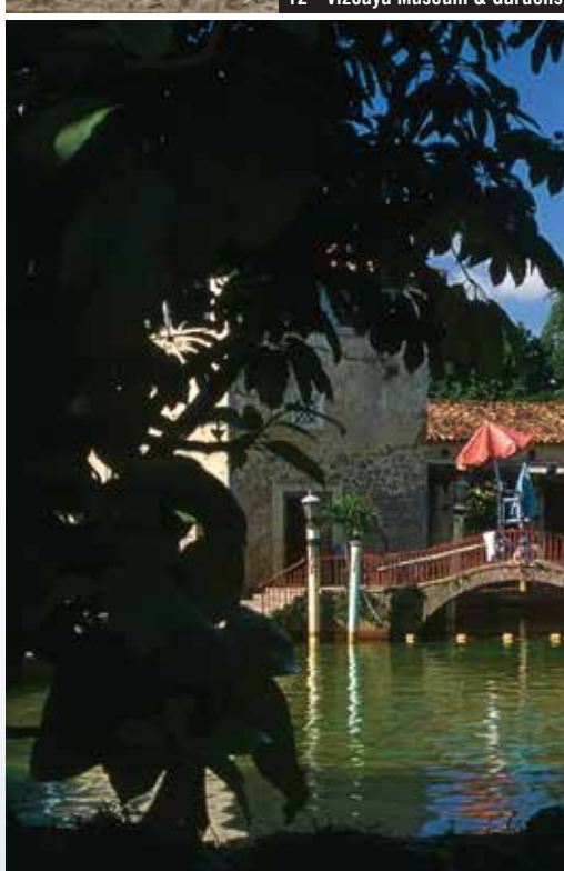
23 - Venetian Pool, Coral Gables