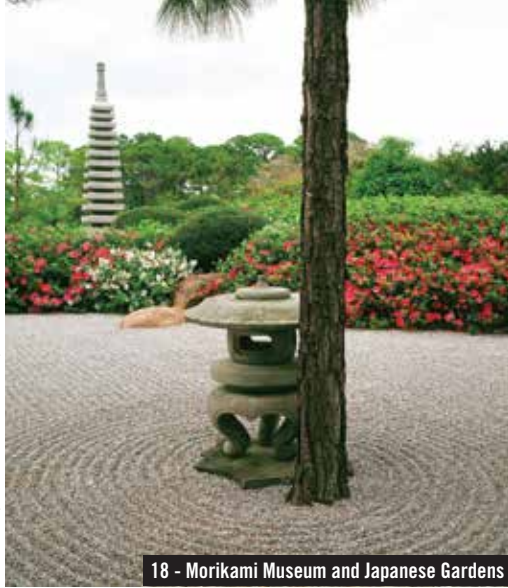
18 - Morikami Museum and Japanese Gardens

MEET: Entrance Station/Gift Shop, 11000 South Red Rd, Pinecrest GUIDE: Pinecrest docent 🚌 Route 57 P Parking on Red Road