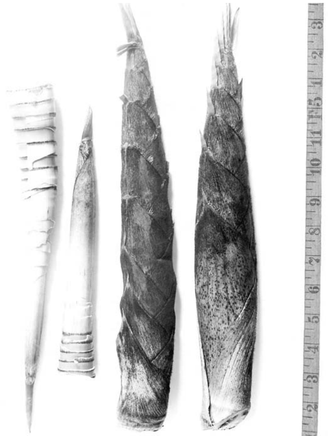
First fruits: four Moso shoots (two peeled, two unpeeled) from E.A. McIlhenny’s initial shipment to David Fairchild, April 1915. (EAMC)

I have had a photograph taken of these shoots and will send you a copy of it for your own use. [See below.]